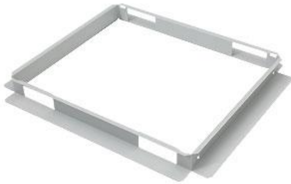
RAB-CH-XXX-X1, RAC-CH-XXX-X1 Bottom fixing frame for fan unit

The installation of fan units is prepared for Tritón cabinets only.